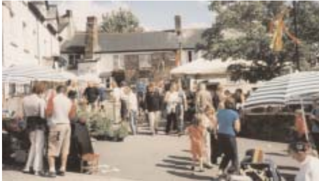
Stalls at the Hatherleigh Festival

Hatherleigh Arts Festival. Mid July. Four days of contemporary arts, including theatre, concerts and art exhibitions, street theatre and workshops.