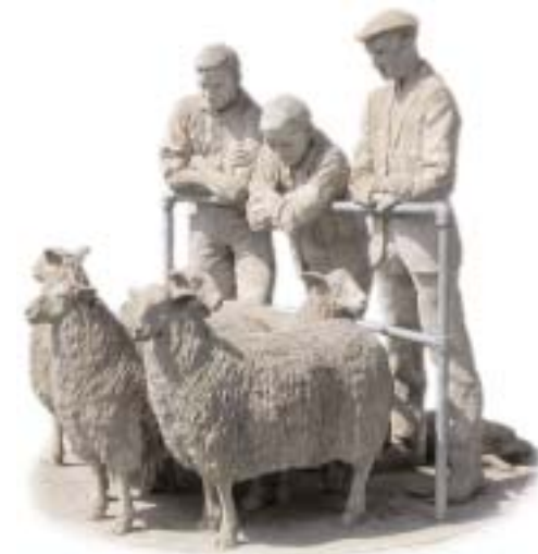
Roger Dean's 'Sheep Sculpture' by the car park

Hatherleigh is a place apart – an ancient Market Town of cob and thatch cottages situated in the heart of rural Devon in one of the few places where tranquillity can still be found and the stars seen at night.