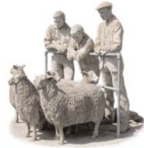
Roger Dean's 'Sheep Sculpture' by the car park

Hatherleigh is a place apart – an ancient Market Town of cob and thatch cottages situated in the heart of rural Devon in one of the few places where tranquillity can still be found and the stars seen at night.