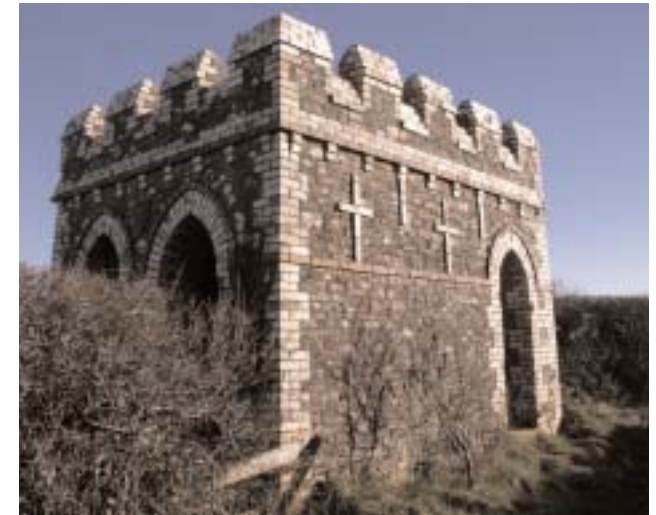
Stunning views can be seen from the Belvedere, which is beyond the Health Centre on one of the town trails.

Hatherleigh's central position makes it an ideal location from which to explore this area of Devon and whichever direction you take, within only an hour's drive there are attractions to suit every interest. From the historic city of Exeter to the Eden Project or Exmoor, from Theme Parks to Art Centres and Abbeys, there is something for everyone.