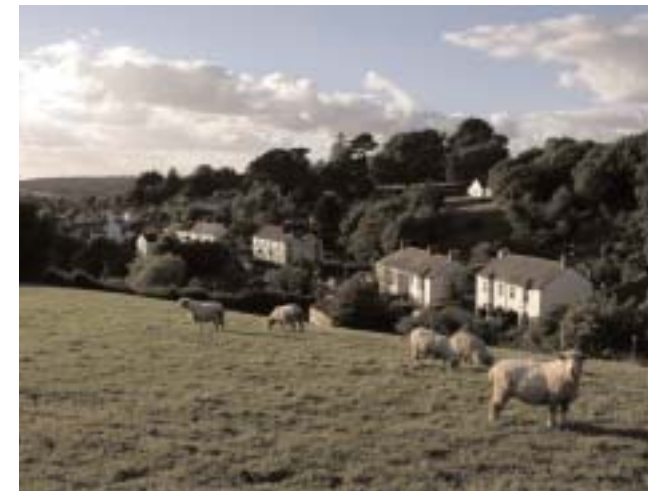
Pastural View from Victoria Road across the town

The natural beauty of the landscape of Devon's Culm Measures, its wildlife, habitats and diversity can be enjoyed at the nearby Halsdon Nature Reserve, with riverside walks and bluebell woods, or at the Green Gateway Centre at Cookworthy. There is ample game and course fishing on lakes at Stafford Moor and Legge Farm and on the River Torridge. There is a choice of heated indoor swimming pools nearby as well as a tidal saltwater pool at Bude. The area also boasts a number of excellent golf courses and horse riding facilities.