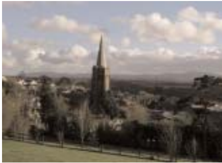
Hatherleigh with Dartmoor in the distance