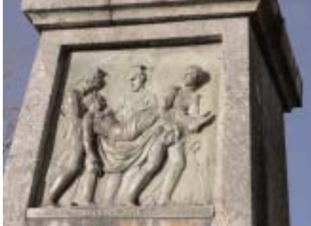
The Col. Morris Monument