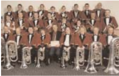
Hatherleigh Silver Band

The George Hotel dates from late medieval times and was once the principal stage for coaches travelling to Bideford, Plymouth, Bude and Exeter.