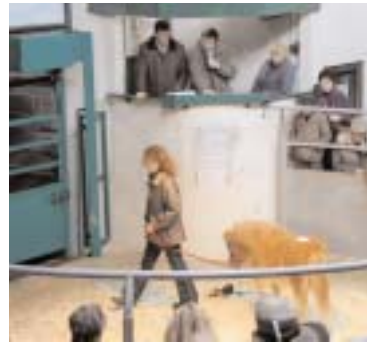
Pony Sale in the Market

Today, Hatherleigh is not simply picturesque, but a working landscape and town, home to an active and welcoming community where history and tradition blend comfortably with modern life. Part of that tradition can be seen at Hatherleigh Market on a Tuesday morning where, for generations, farmers have gathered to buy and sell their livestock.