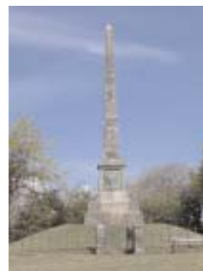
The Col. Morris Monument

The Parish Church of St. John the Baptist dates from the 15th century but has been found to contain fragments dating from Norman times. The church became famous nationally in 1990 when the medieval wooden spire was blown over during a great storm, crashing through the nave roof and causing extensive damage. Thankfully the church has now been restored to its former glory. Other interesting and historic buildings include Thomas Roberts House – Hatherleigh's first school, and the Methodist Chapel with its beautiful stained glass window created by the monks of Buckfast Abbey.