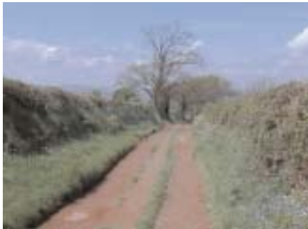
The Tarka Trail near Hatherleigh