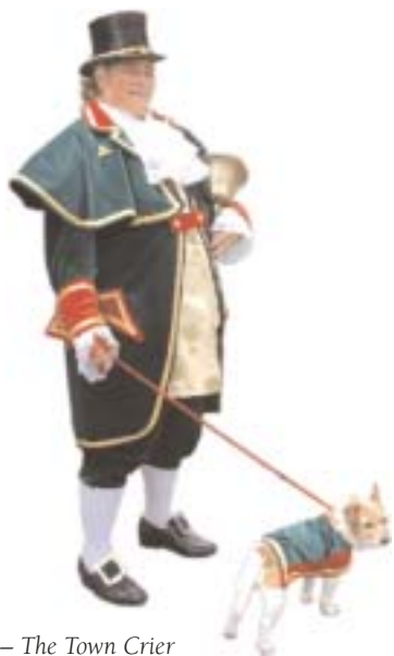
Roz – The Town Crier