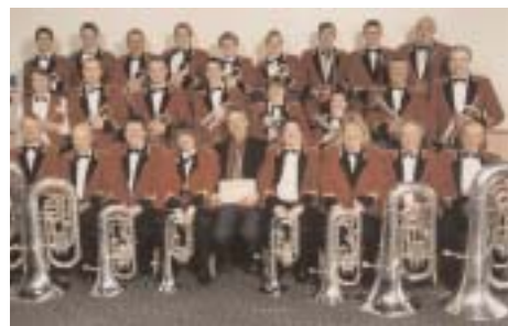
Hatherleigh Silver Band

The George Hotel dates from late medieval times and