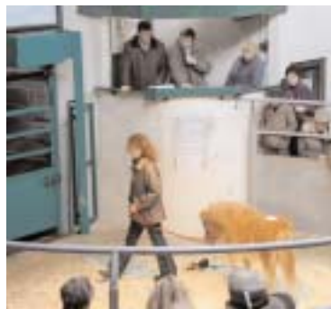
Pony Sale in the Market

Today, Hatherleigh is not simply picturesque, but a working landscape and town, home to an active and welcoming community where history and tradition blend comfortably with modern life. Part of that tradition can be seen at Hatherleigh Market on a Tuesday morning where, for generations, farmers have gathered to buy and sell their livestock.